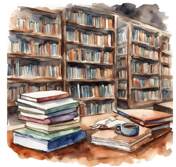
Explore a local museum or head to the library