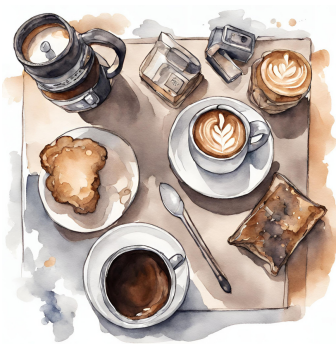
Explore local coffee shop culture