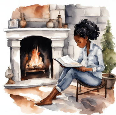
Read by the fire