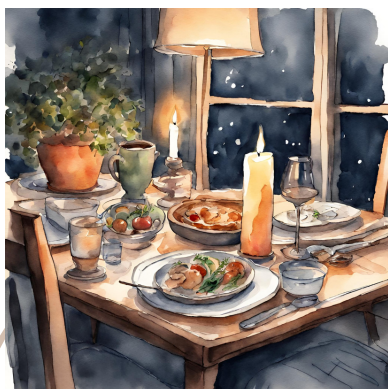
Have a candlelit evening