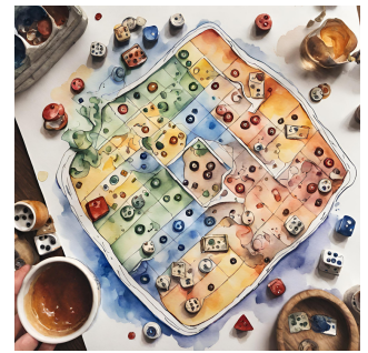
Play a new board game