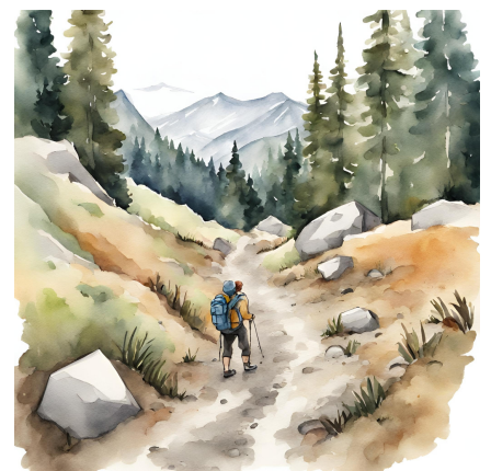
Take a winter hike