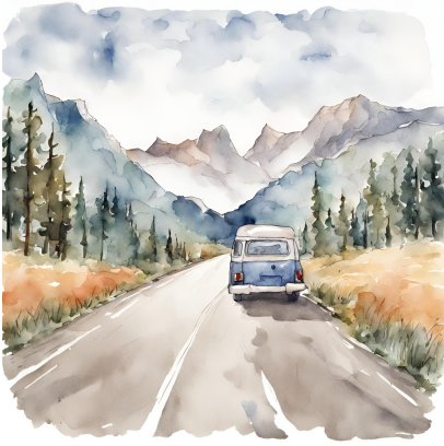
Plan a low-key roadtrip