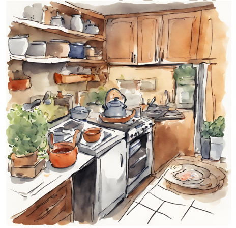
Cook a pot of soup or bake up a storm