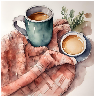
Refresh your cozy collection