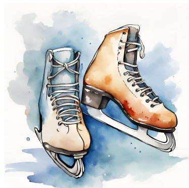
Go ice skating